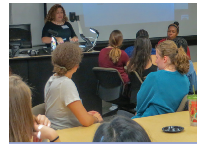
Participants engaging in an exciting WLI session.