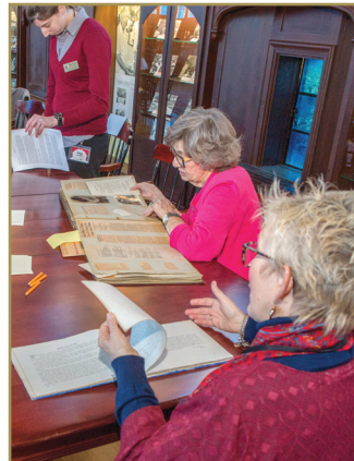
Participants peruse artifacts for the spring display they created at the Heritage Museum.