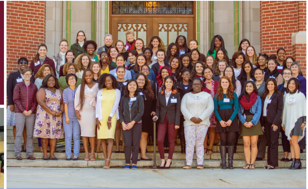
2017 Women's Leadership Institute