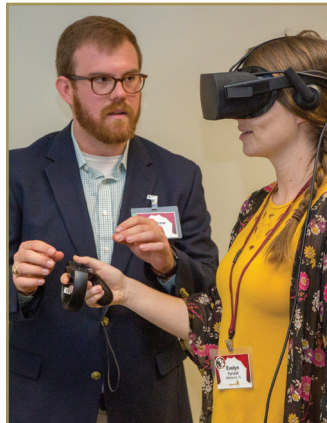
Attendees experienced virtual reality during the archaeology programming.